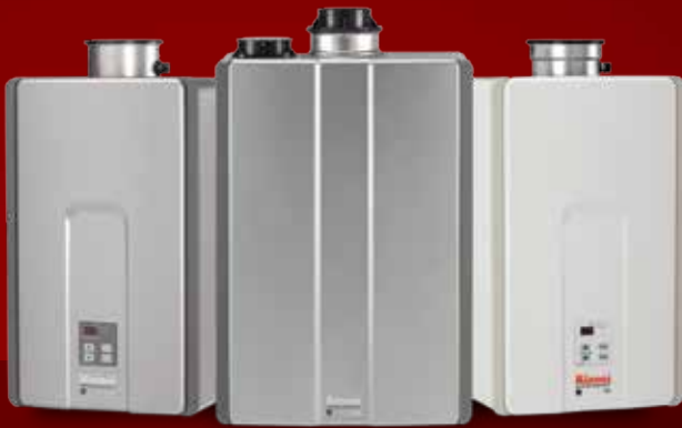
RINNAI TANKLESS WATER HEATERS