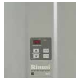
INTEGRATED TEMPERATURE CONTROLLER

Most Rinnai Tankless Water Heaters come standard with an MC-91-1US or MC-91-2US digital temperature controller — either integrated into the front panel of indoor tankless models or wall-mounted in a suitable location for outdoor models. Rinnai RUR Series Tankless Water Heaters come standard with an MC-195T controller that also regulate the recirculation function.